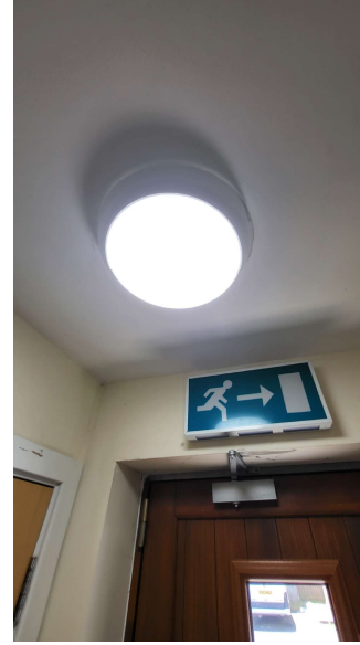
Lighting (Standard and Emergency Lights)