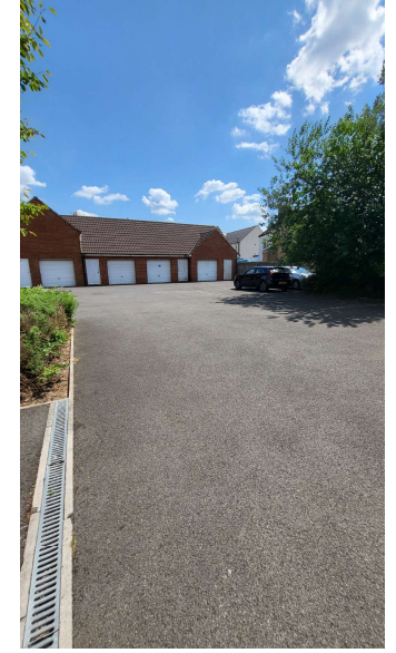
Communal Grounds (Gardens and Common Areas)