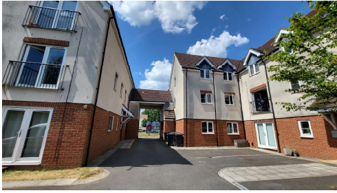
Exterior Structure (The Building)