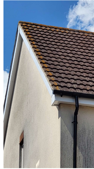
Roofing (Tiles and Cladding)