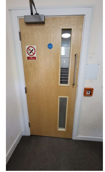
Internal Doors (Compartment Doors)