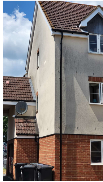
Guttering (Gutters and Fascia)