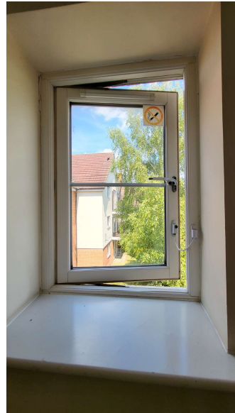
Windows (Communal Windows)