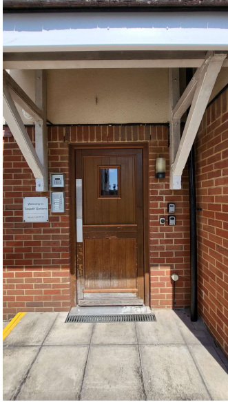
Entrances (Main Doors)