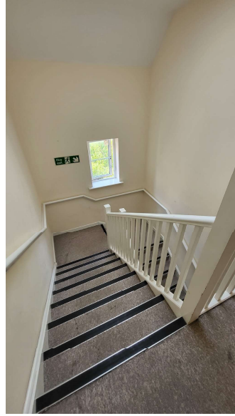
Hallway (Communal Lobbies and Stairs)