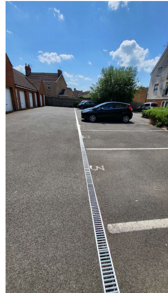
Car Park (Vehicle Parking)